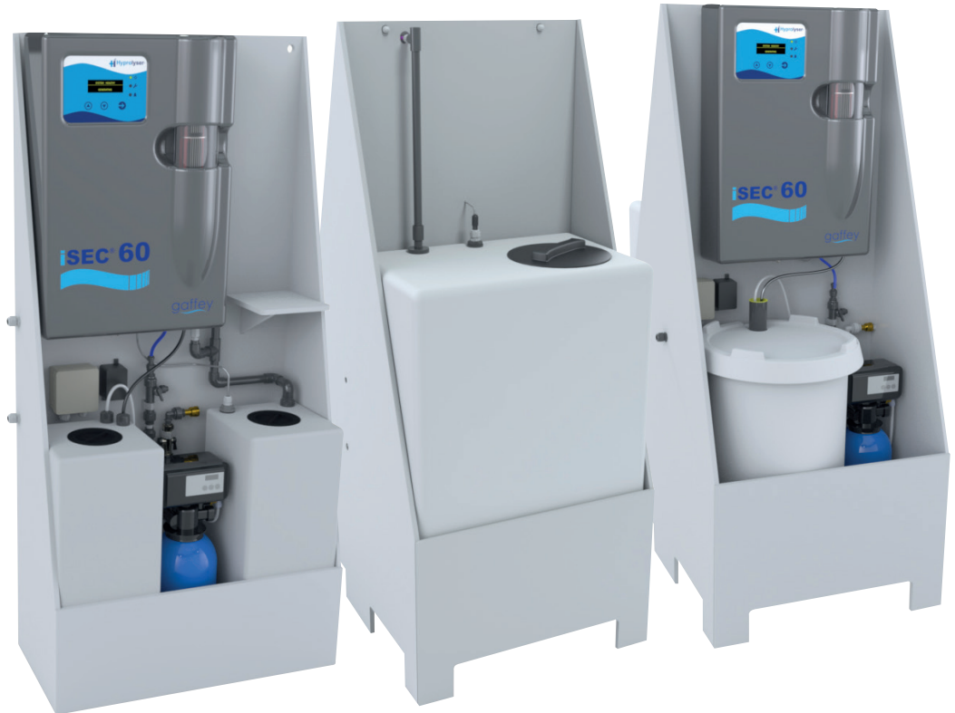
SKID-I 30kg saturator / 30 litre product tank

The Hyprolyser iSEC range is ideal for smaller scale chlorine demands. Skid systems are a complete package for simple and quick installation. Supplied pre-built and tested including softener, salt saturator and chlorine product storage tank.